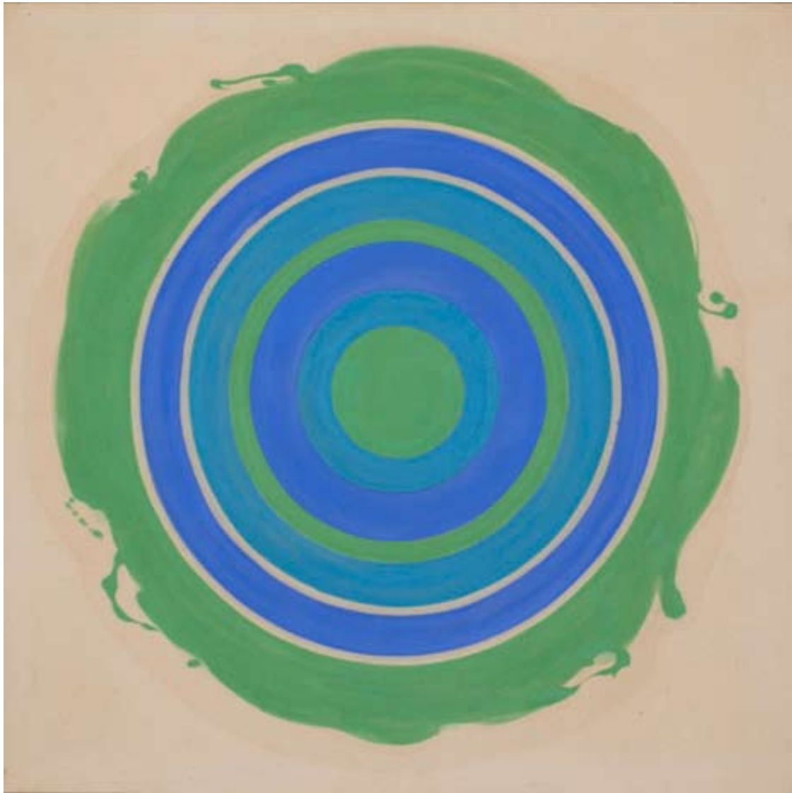
KENNETH NOLAND Untitled , c. 1960 Acrylic on canvas, 36 x 36 inches