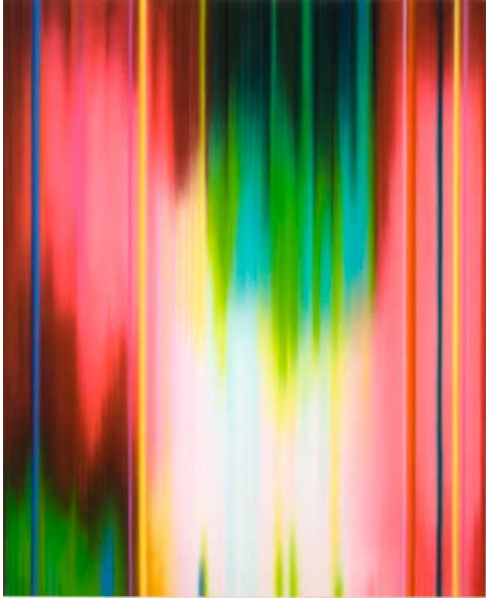
TIM BAVINGTON Magic Pie , 2010 Synthetic polymer on canvas, 96 x 78 inches