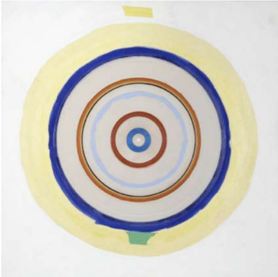
KENNETH NOLAND Chirp , 1998 Acrylic on canvas, 24.5 x 24.5 inches