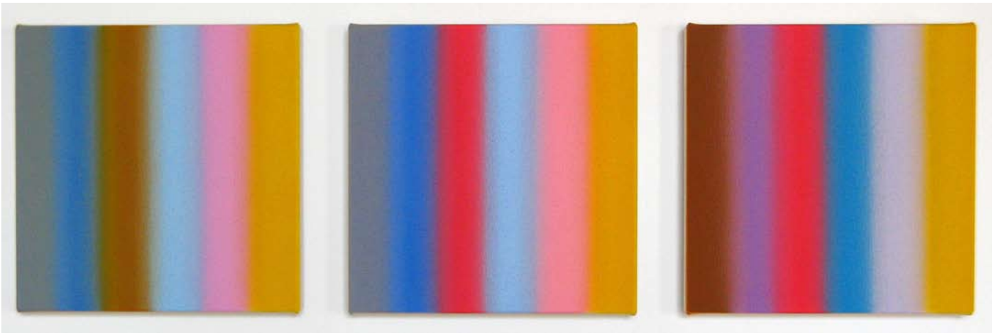
TIM BAVINGTON 3 Relative Minor Chords in C , 2008 Synthetic polymer on canvas, 3 canvases: 12 x 12 inches each