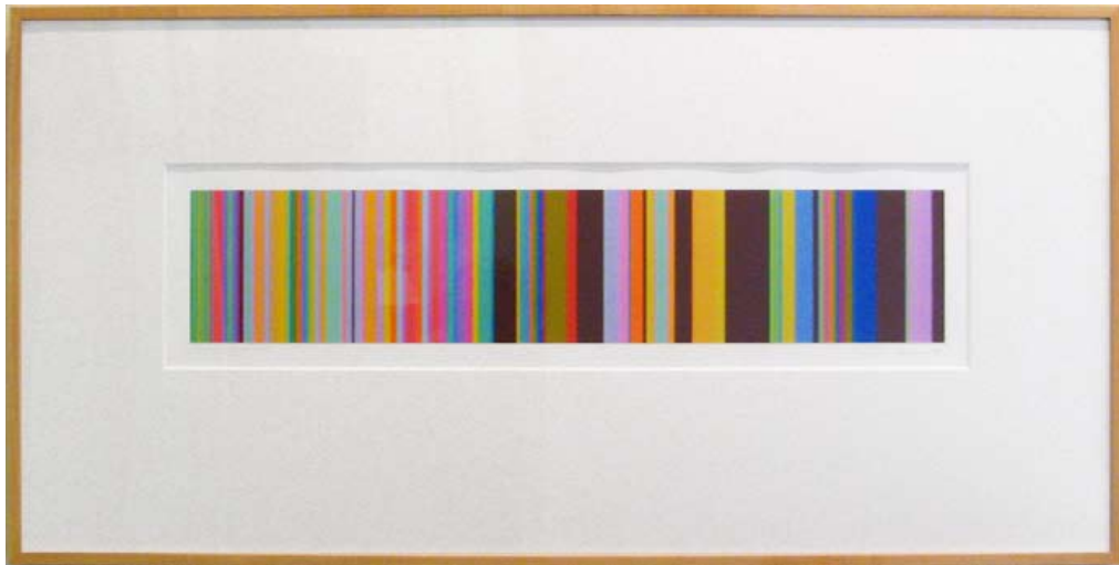
TIM BAVINGTON Good Times Bad Times and Good Times Bad Times Study Synthetic polymer on canvas and paper, painting: 24 x 120 inches, study: 6 x 30 inches