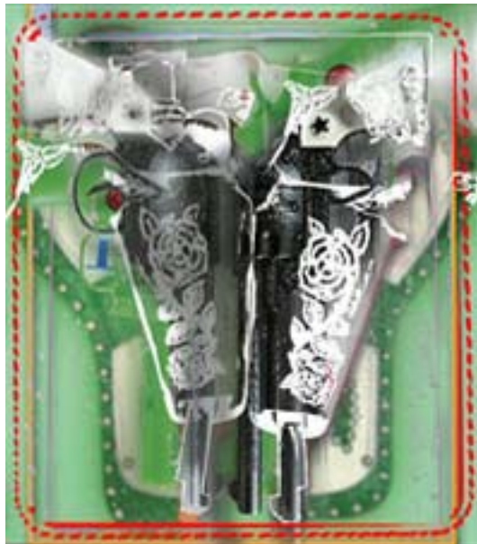
“Rose” 2009 Pigmented inkjet print 18 x 16 inches Edition of 10