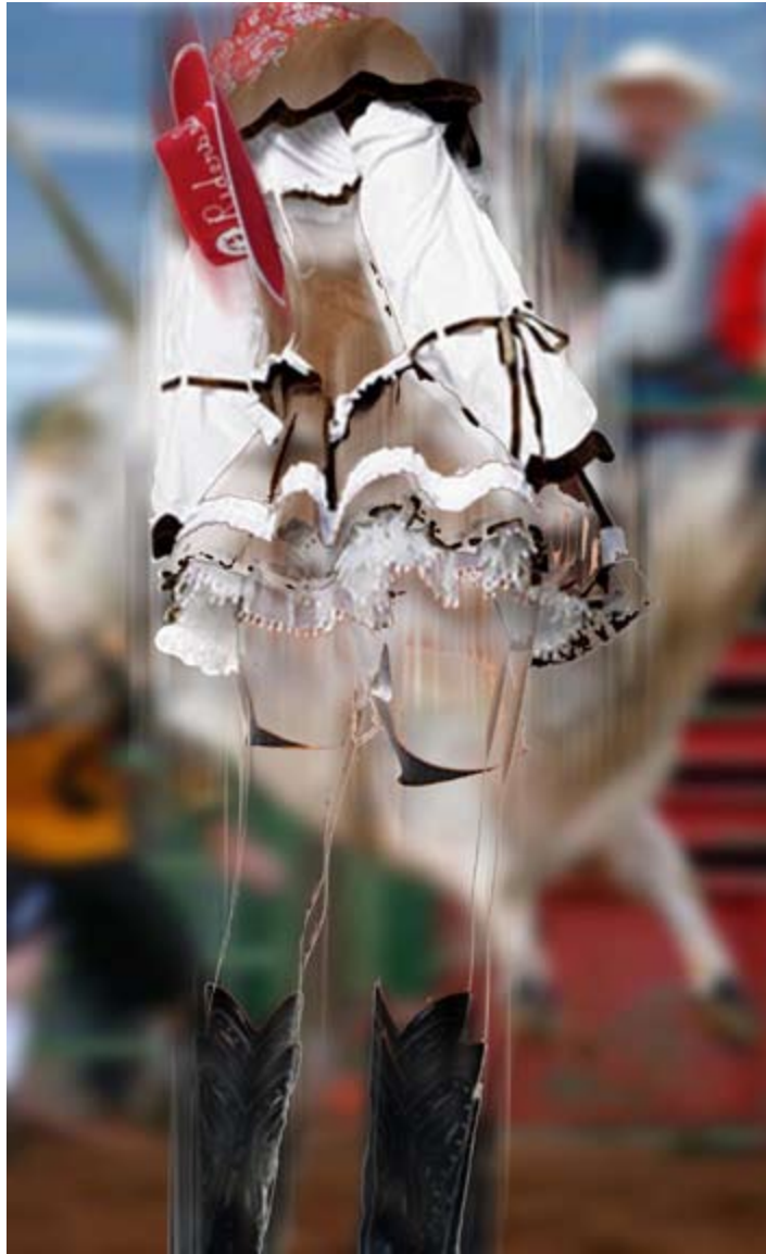
“Cody” 2009 Permanent pigment print on aluminum 81 x 51 inches Edition 3/3