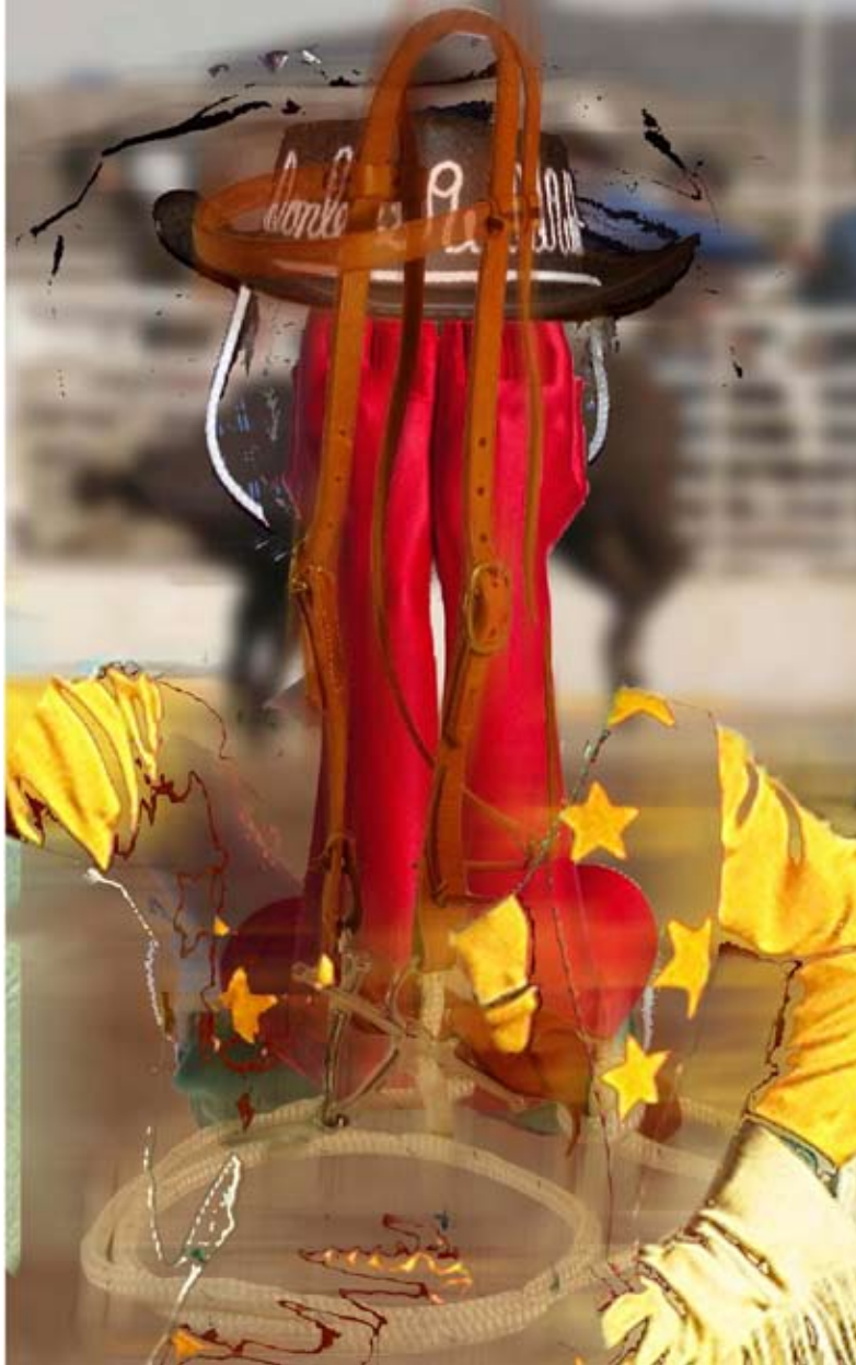
"Montana" 2009 Permanent pigment print on aluminum 51 x 33 inches Edition 1/3