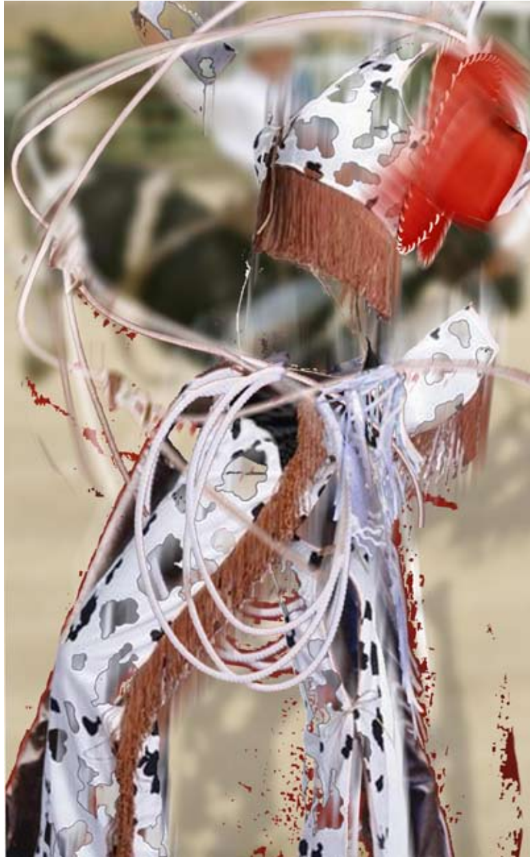
"Palomino" 2009 Permanent pigment print on aluminum 81 x 51 inches AP