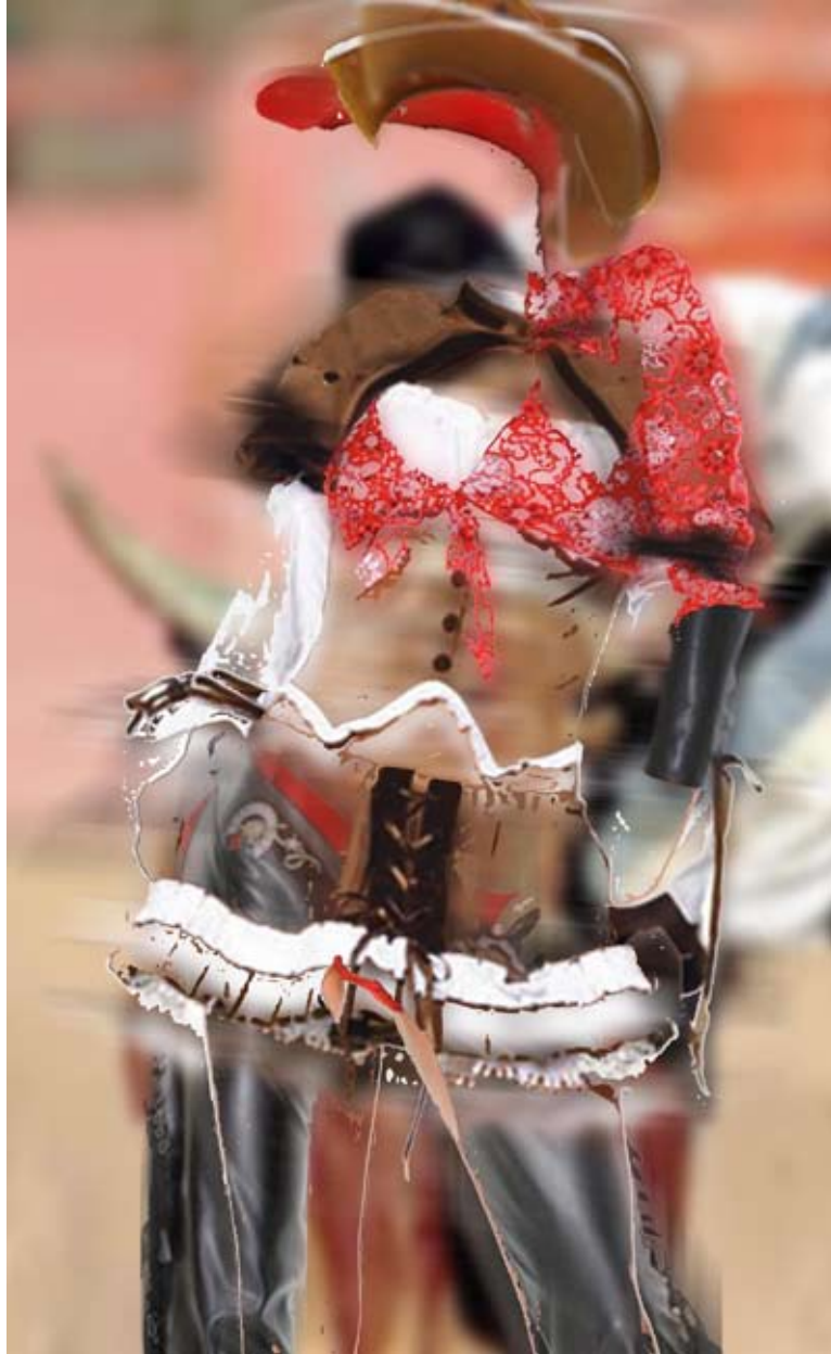
“Randi” 2009 Permanent pigment print on aluminum 81 x 51 inches Edition 1/3