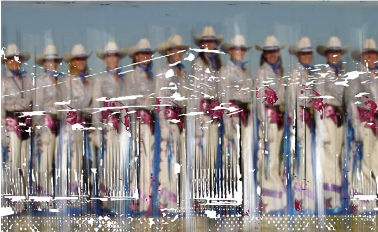
“Drill Team” 2009 Permanent pigment print on aluminum 81 x 51 inches Edition 3/3