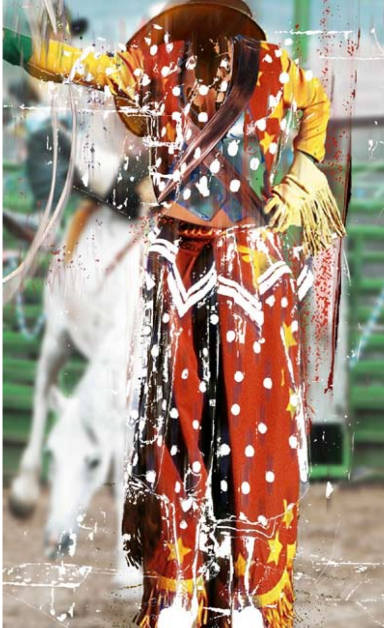
“Ranger” 2009 Permanent pigment print on aluminum 81 x 51 inches Edition 3/3