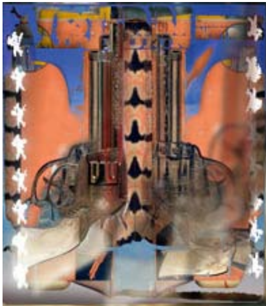
“Gene” 2009 Pigmented inkjet print 18 x 16 inches Edition of 10