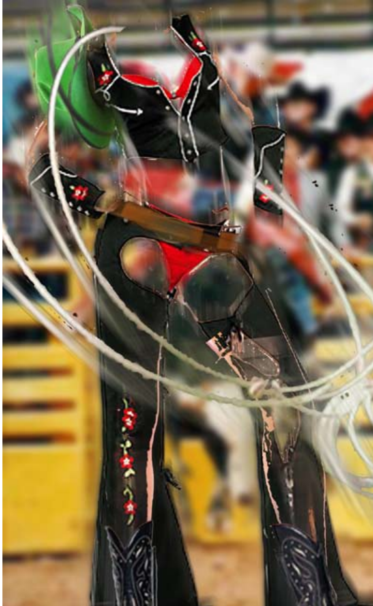
"Dallas" 2009 Permanent pigment print on aluminum 81 x 51 inches Edition 2/3