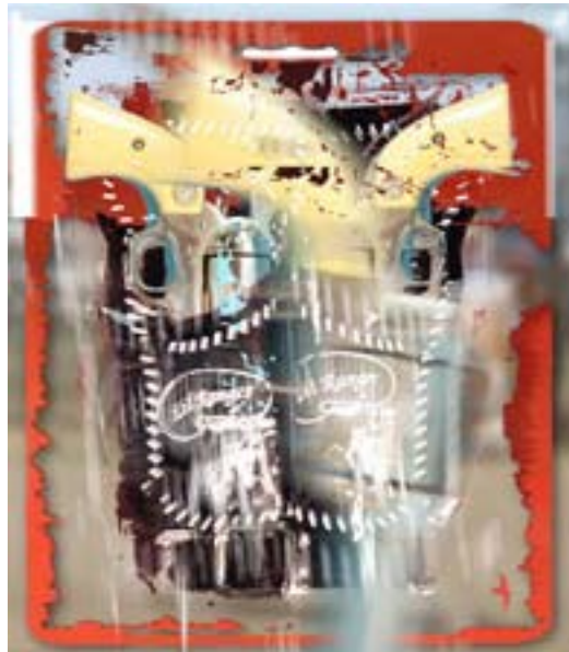
“Lil Ranger” 2009 Pigmented inkjet print 18 x 16 inches Edition of 10