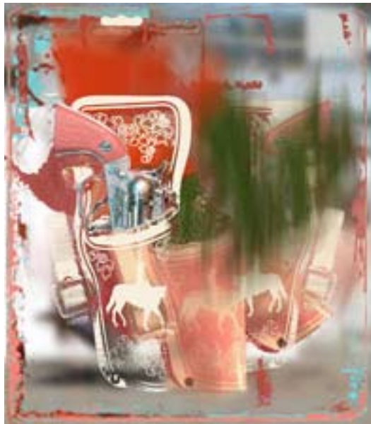
"Loretta" 2009 Pigmented inkjet print 18 x 16 inches Edition of 10